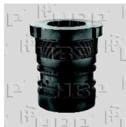
Head End Cover