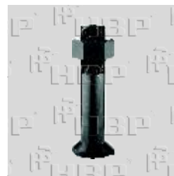
Hydra Clamp Bolt Nut